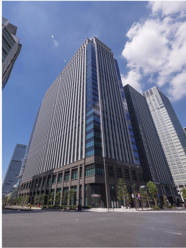
SocialGood, Inc.'s new headquarters location in Tokyo.

YouTube: https://www.youtube.com/@socialgoodinc/