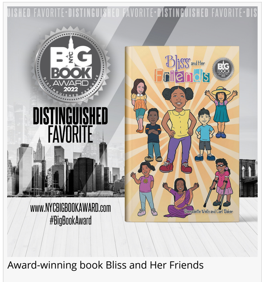
Award-winning book Bliss and Her Friends

This competition is judged by experts from different aspects of the book industry, including publishers, writers, editors, book cover designers and professional copywriters. Selected award winners and distinguished favorites are based on overall excellence.