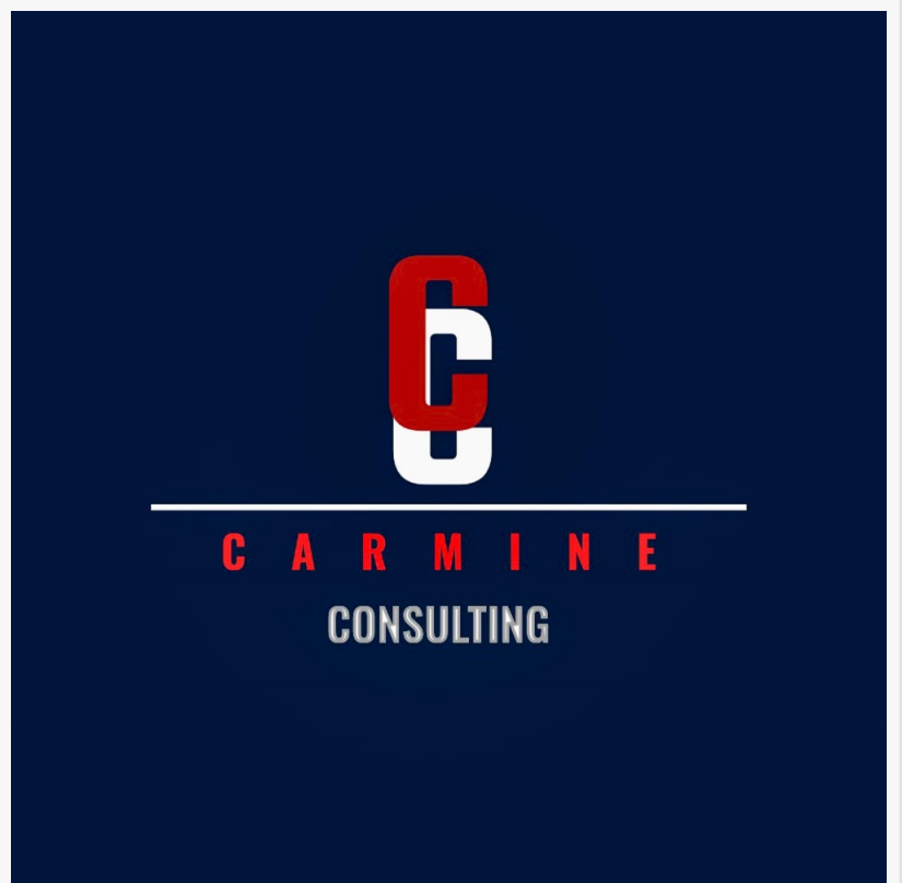
Carmine Consulting LLC