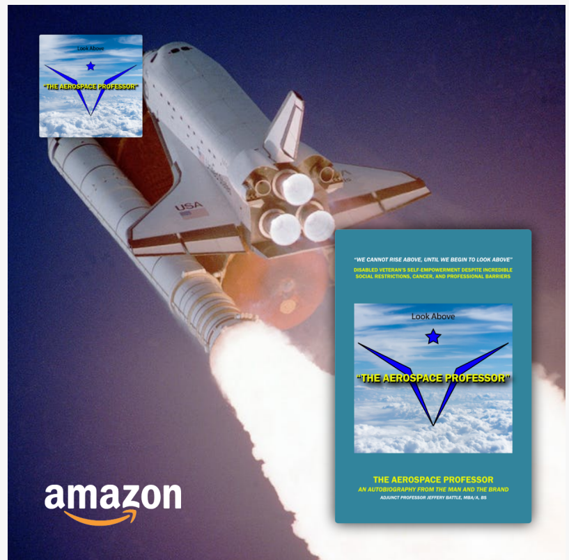
The Aerospace Professor autobiography front cover posting image