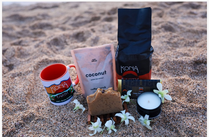
Ultimate Hawaiian Spa Day Gift Set