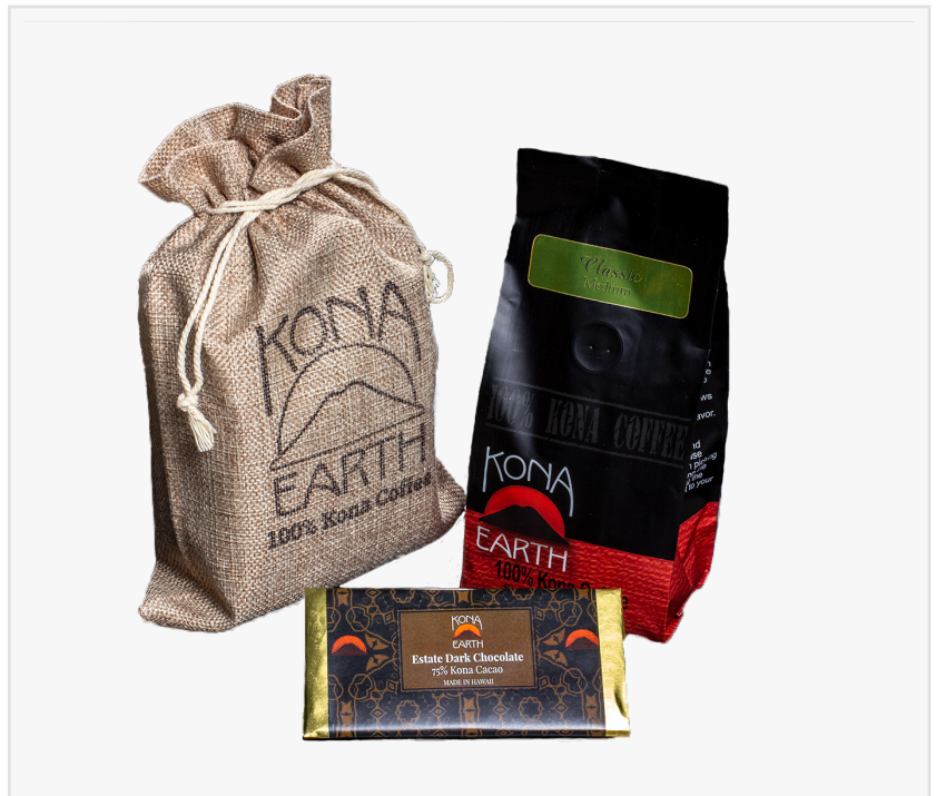
Kona Coffee & Chocolate Gift Pack

Only grown in this region, the Kona Typica variety has a well-earned reputation for consistent high quality and excellence. Kona Earth's farm is located at 2200 feet in elevation. With cooler temperatures and more rain, the coffee trees mature slowly, giving the fruit more time to develop and ripen. This translates to lush fruit, large beans, and robust flavor. And as one of the only specialty coffees grown in the US, Kona coffee farms pay workers a living wage, so consumers can rest assured that Kona Earth's coffee is fair trade and ethically sourced.