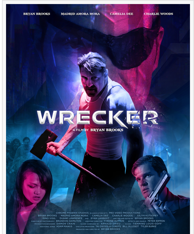
Official Wrecker Movie Poster

"You don't know if you will have success in this business. And I'm not sticking to a predictable storyline, so I don't know if people will like my film. A studio film with millions of dollars can