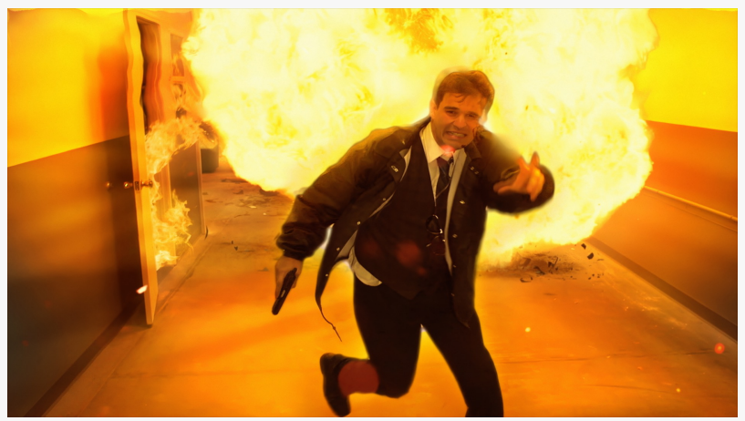
Detective Knight Runs For His Life