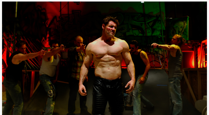
John Hoping for a Miracle

This press release can be viewed online at: https://www.einpresswire.com/article/605531967