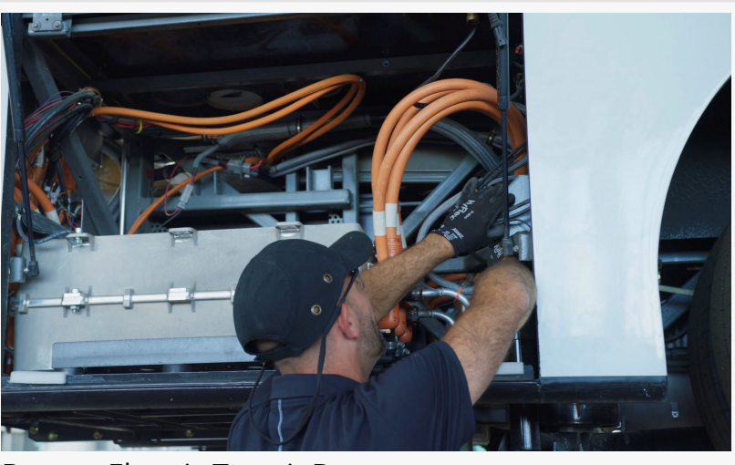
Battery Electric Transit Bus