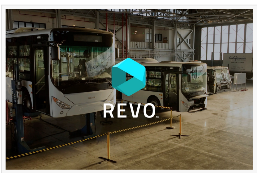
REVO Powertrains Facility in Alameda

ALAMEDA, CALIFORNIA, UNITED STATES, December 13, 2022 /EINPresswire.com/ -- <u>REVO</u> <u>Powertrains</u>, a supplier of electric vehicle (EV) powertrains for mediumand heavy-duty vehicles, today announced the launch of its Regulation <u>Crowdfunding capital raise</u> on the StartEngine platform. Proceeds from the crowdfunding campaign will be used to commercialize its powertrain