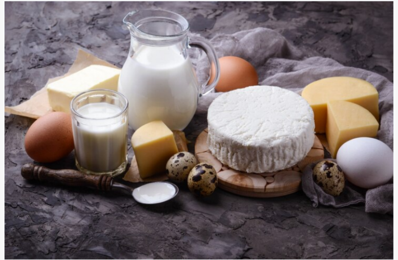
Dairy Ingredient Market

However, the world has seen a rise in the popularity of veganism and this is expected to have a negative impact on the Dairy Ingredient market growth through 2028. Increasing demand for alternative products has resulted in high availability of other plant based products which are in turn driving a negative sales trend for the Dairy Ingredient. Dairy Ingredient companies are focusing on diversifying their offerings in order to keep up with the trend and avoid losses in the long run.