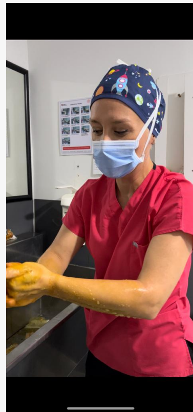
Application of gastric balloon does not require incision or surgery