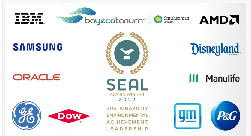
SEAL Award 2022 Honorees