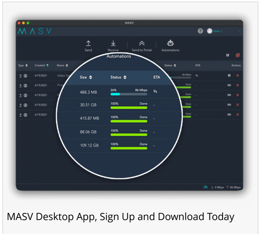
MASV Desktop App, Sign Up and Download Today

Volume Pricing is now available for all Customers. This means all users can choose from Pay-As-You-Go (PAYG) pricing, Prepaid Transfer Credits, or a combination of the two. New Prepaid Transfer credits are available today from https://massive.io/pricing and can save users up to 40% compared to pay-as-you-go-pricing. Customers who require more than 50TB annually will have access to customized features and plans.