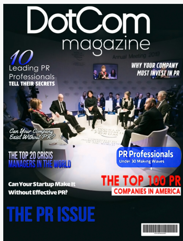
The DotCom Magazine Entrepreneur Spotlight Series- The Power Of Video