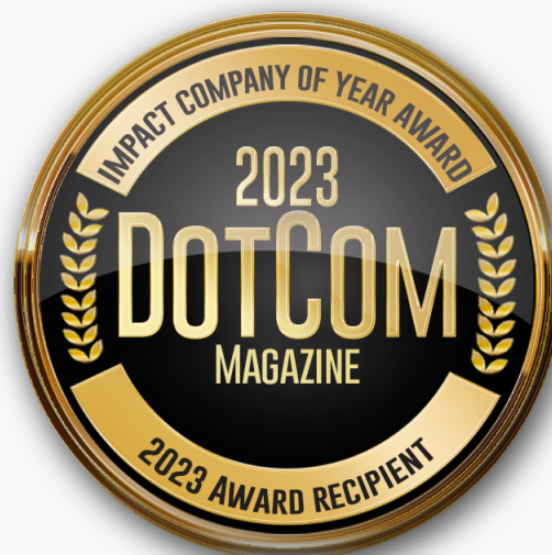
The DotCom Magazine Entrepreneur Spotlight Series- Impact Company

important video series, we consider the newsworthiness of the story and what our viewers want to learn about. If something is important to our viewers, it is important to DotCom Magazine. The people at DotCom Magazine believe in including a diverse range of entrepreneur voices in our interviews, and actively pursuing entrepreneurs making a positive difference in the world.