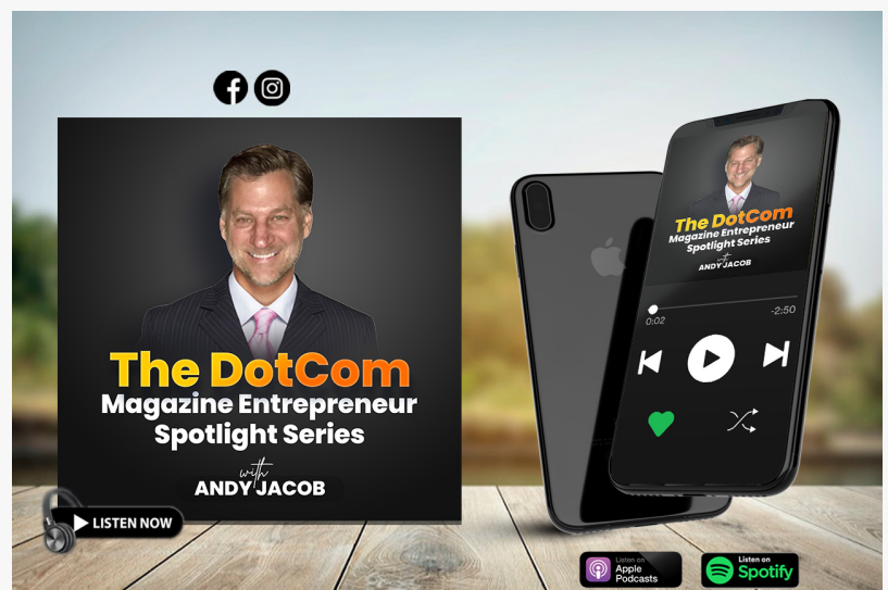
The DotCom Magazine Entrepreneur Spotlight Series-Cover Story