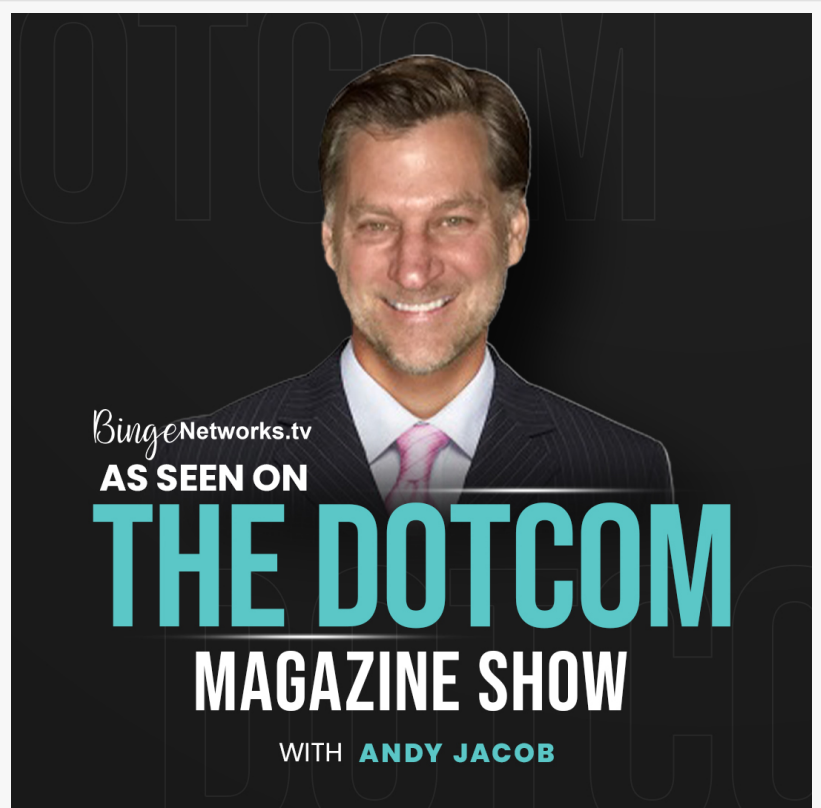
The DotCom Magazine Entrepreneur Spotlight Series-Featured Interview