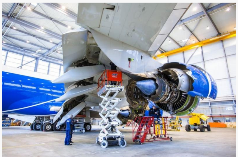
Aviation Test Equipment Market

Apparently, Aviation Test Equipment Industry is set to register humungous gains of nearly 4.25% in time interval of 2022 to 2028. Moreover, expansion of aviation test equipment industry over coming years is attributed to rise in research & development activities related to high tech innovations in aviation test equipment. In addition to this, massive product demand from aircraft manufacturers has led to increase in production of aviation test equipment, thereby augmenting revenue of aviation test equipment market. Nevertheless, reduction in allocation of funds for defense, low lifespan of avionics, and maintenance of legacy tools are projected to put brakes on aviation test equipment industry surge.