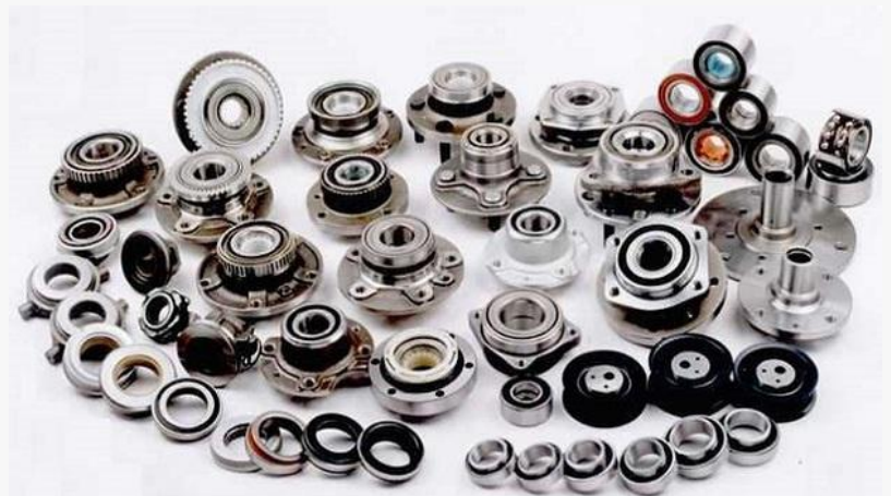
Automotive Hub Bearing Market