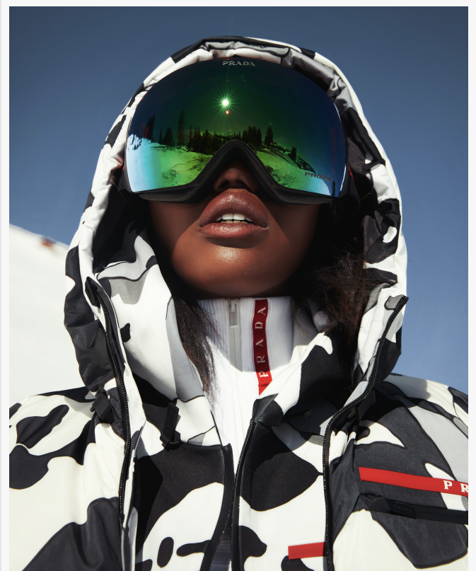
Prada & ASPENX limited-edition collection women's ski performance apparel inspired by the winding trail maps in Aspen, Artist Paula Crown Collaboration

The Winter 2023 ASPENX Prada collection, is a premium extension of Prada Linea Rossa, and is a