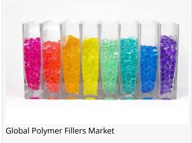
Global Polymer Fillers Market