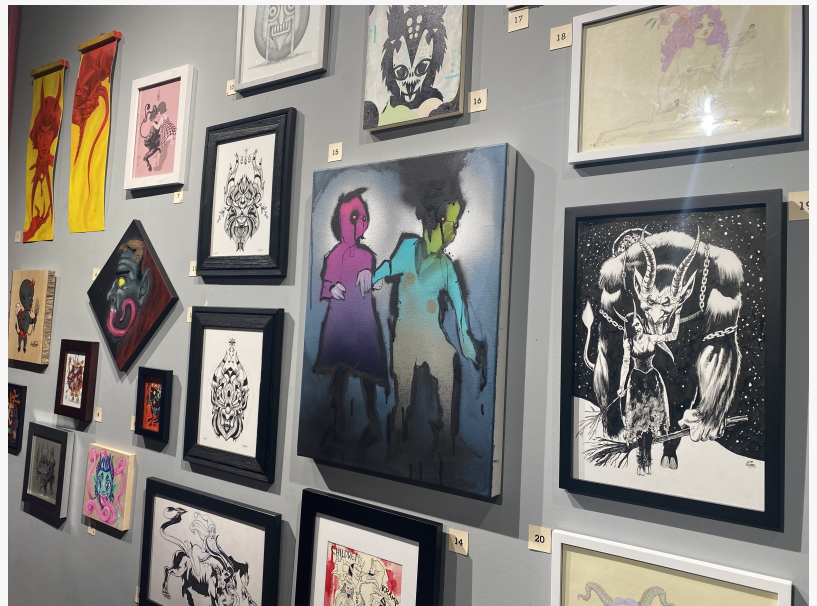
The Seventh Corner Gallery Krampus Art Show | December 21, 2022

This press release can be viewed online at: https://www.einpresswire.com/article/606079788