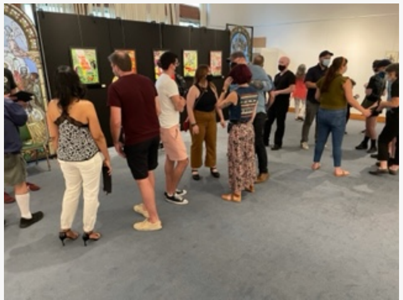
The Seventh Corner Gallery September 21, 2022 Show | Irish American Heritage Center