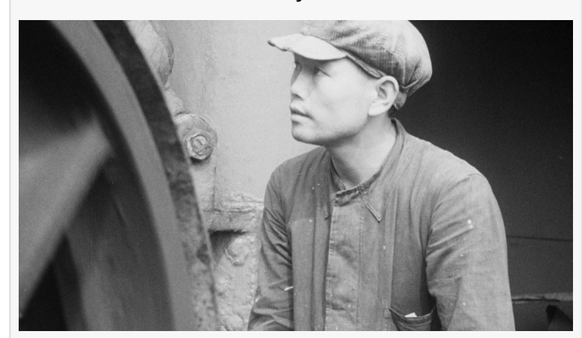
The identity of many of the men who disappeared is not even known