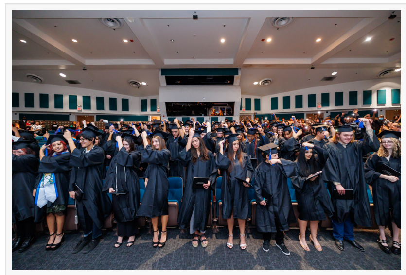
100 young people who might otherwise have dropped out turned the tassels on their caps and embarked on the next chapter of their lives as graduates of Clark County Acceleration Academies

Her grades rebounded strongly, so much so that she's qualified for a Millenium Scholarship, which provides up to $10,000 a year for high-achieving