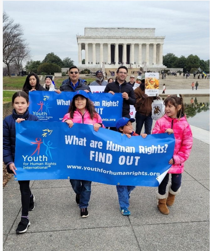
Youth led the way to promote human rights

Youth for Human Rights International (YHRI) is a nonprofit organization with chapters around the world whose mission is to teach youth about human rights, specifically the United Nations Universal Declaration of Human Rights, and inspire them to become valuable advocates for