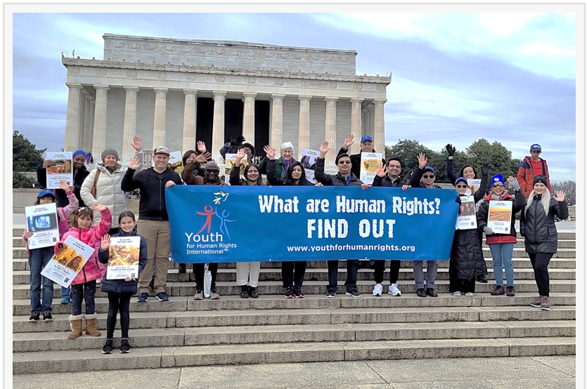
Youth and adult advocates gather at the Lincoln Memorial to promote the need to know your human rights

WASHINGTON, DC, USA, December 14, 2022 /EINPresswire.com/ -- In a world where fundamental human rights are still being abused, a group of youth advocates took action by leading a Human Rights Day walk in support of the thirty rights adopted by the United Nations in 1948 as one of its foundational documents. The walk commenced from the Lincoln Memorial and fittingly culminated at the World War II Memorial in Washington, DC.