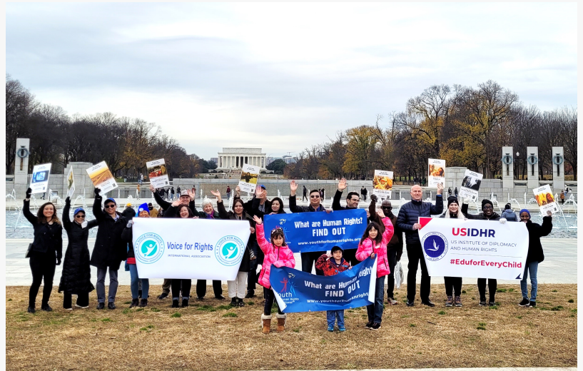
The #StandUp4HumanRights walk ended at the World War II Memorial