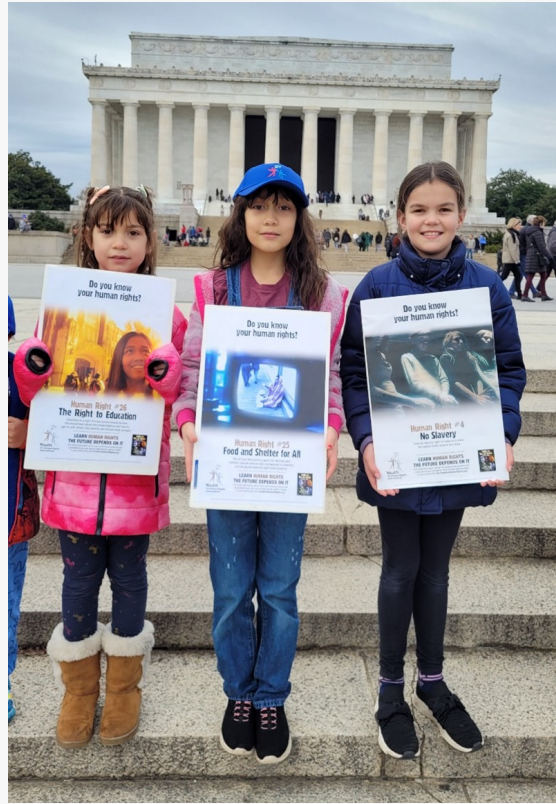
Youth for Human Rights mini posters promote specific rights under the UN Universal Declaration of Human Rights

The walk was part of a global series of events led by Youth for Human Rights International in honor of Human Rights Day and on the occasion of the 74th Anniversary of the UN Universal Declaration of Human Rights (UDHR), the document which, if widely applied, could end human