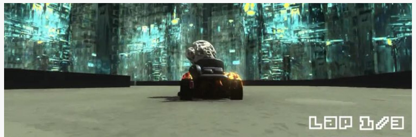
Kartsy Monke Screenshot