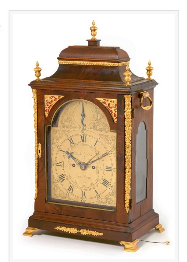
Chippendale gilt bronze mounted mahogany bracket clock, Charles Geddes, New York, circa 1795 (est. $2,000-$3,000).

Aileen Ward Andrew Jones Auctions +1 213-748-8008 email us here