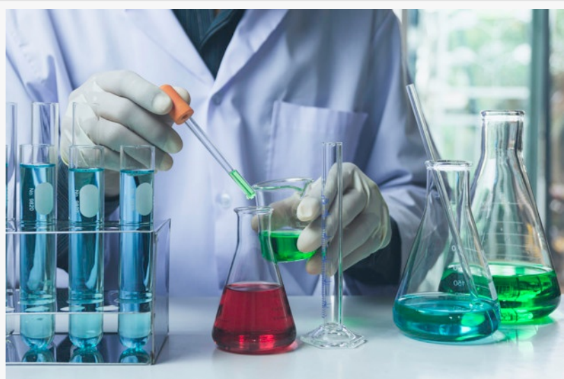
Water Treatment Chemicals Market

Moreover, the environmental and human health hazards associated with the use of Water Treatment Chemicals are expected to have a restraining effect on the global Water Treatment Chemicals market. Increasingly strict mandates against the use of hazardous chemicals and rising awareness among the general population will also be a major barrier for water treatment chemicals companies in the long run.