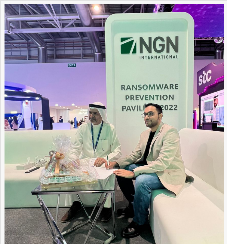
NGN International and PowerDMARC expand their operations in Bahrain

Bahrain-based managed security service provider NGN International attended the signing-off ceremony at the Arab International Cybersecurity Summit (AICS) 2022, Bahrain, to further their long-standing partnership with leading US-based email authentication SaaS provider, PowerDMARC. This agreement will accelerate the efforts further, after the great success in 2022 in Bahrain.