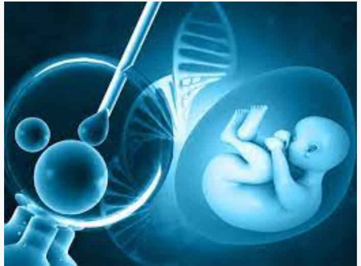
In Vitro Fertilization (IVF) Market

their professions over having children. A greater percentage of women are anticipated to experience difficulty conceiving naturally as the typical age of first-time moms rises. In this situation, more and more ladies are being compelled to choose IVF procedures, which is anticipated to fuel the market's expansion in the ensuing years.