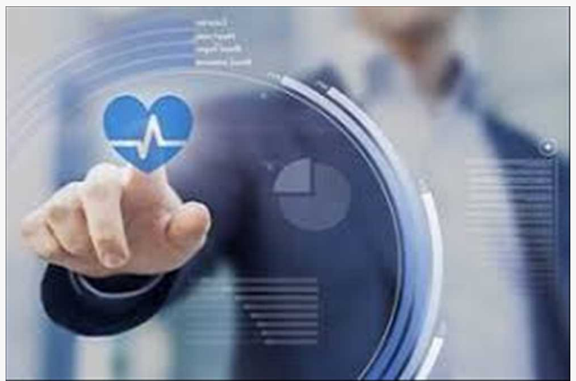
IT-enabled Healthcare Market Demand

Healthcare organizations must implement sound data security management practices to ensure data protection, which will drive the global IT-enabled healthcare market. Interoperability issues related to healthcare IT solutions such as EHR (Electronic Health Records), patient identification, and other healthcare business processes, including clinical policies, impede the use of these services and are indirectly global. Therefore, it is hampering the IT-enabled healthcare market. For services to be executable, various medical IT solutions need to be streamlined and