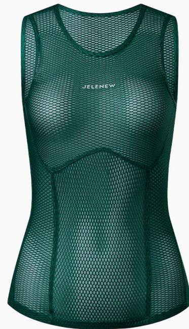
AVANT SLEEVELESS MESH BASE LAYER