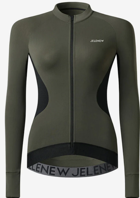
ALLURE BRUSHED LONG SLEEVE PRO JERSEY