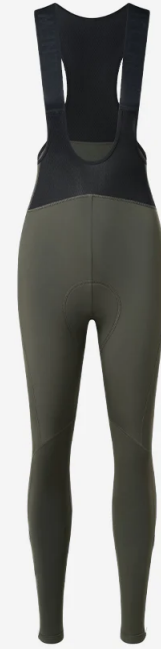
MOMENTUM BRUSHED THERMAL BIB TIGHTS

Jelenew presents to you a bib tights for both thermal regulation and body-shaping effect. The brushed inside of the breathable fabric provides smart temperature regulation, forming an internal heat circulation system to help you make breakthroughs in the cold winter. Inspired by the BMW VISION NEXT 100, which achieves aerodynamics with its outstanding streamline design. Jelenew applies this design concept to our winter bib tights, which use a textured, diamond-shaped dense woven mesh at the waist to form an aerodynamic surface, allowing air to freely enter and exit between the fabric and the skin, creating an aerodynamic effect that automatically regulates body temperature and achieves temperature and moisture balance. The overall aerodynamic design creates a streamlined silhouette and the carefully designed and tailored details help you ride faster and further. And the Elastic Interface® Crossover women's chamois provides up to 7 hours of comfort and protection. The 3D moulded multi-density chamois provides continuous and precise support without discomfort for long-distance riding. The carbon fiber surface prevents bacterial growth. The porous structure can effectively disperse heat and wick away sweat for maximum comfort and protection.