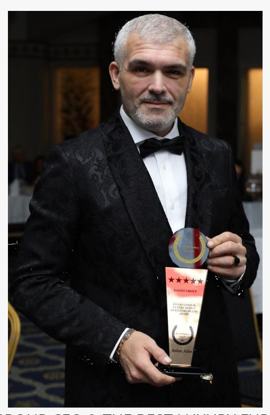
SAGIST GROUP CEO & THE BEST LUXURY FURNITURE DESING BRAND AWARD 2022