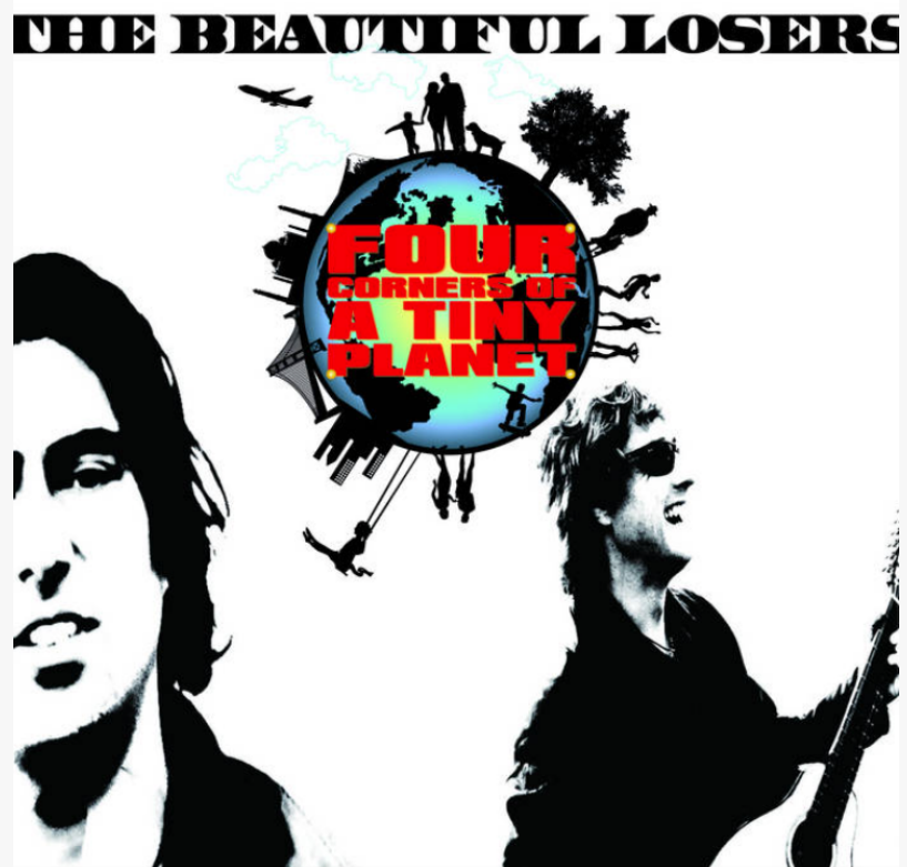
"Four Corners of a Tiny Planet" - The Beautiful Losers, Cover art