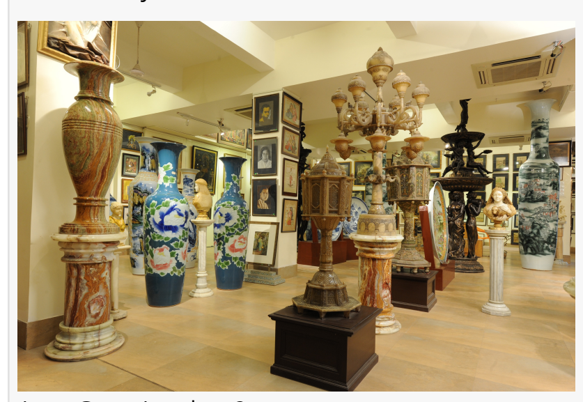
Art-o-Gems Jewelers 2