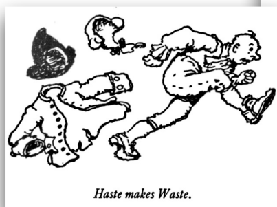
Norman Rockwell Illustrations from Benjamin Franklin Radzi Jak Życ