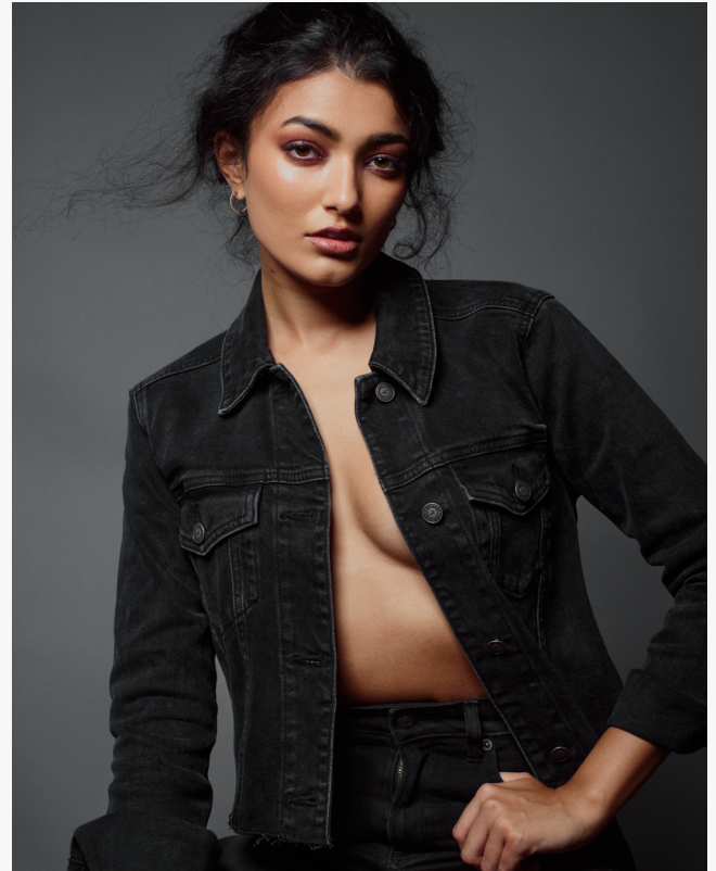
Ferid Portfolio Photo