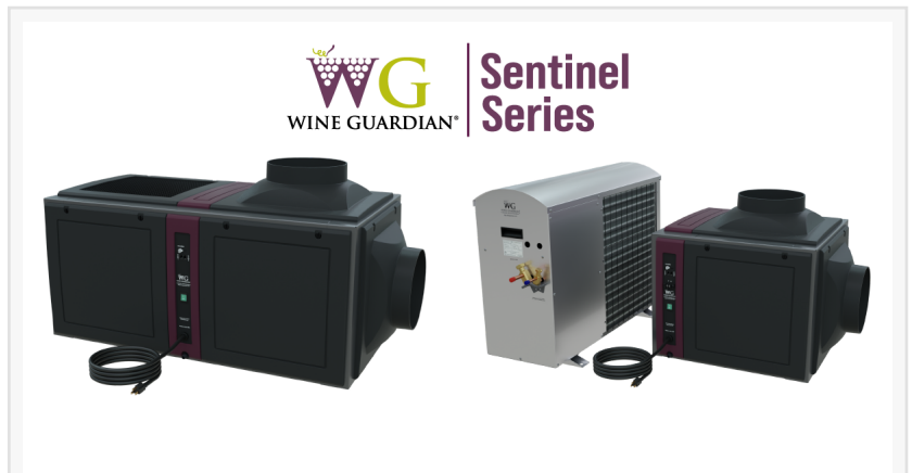
Wine Guardian Sentinel Series Ducted and Ducted Split Systems