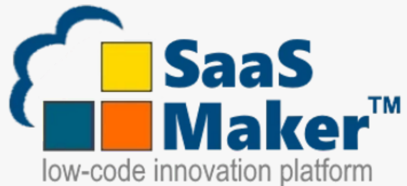
SaaS Maker Logo

Launch a SaaS business from anywhere using low-code