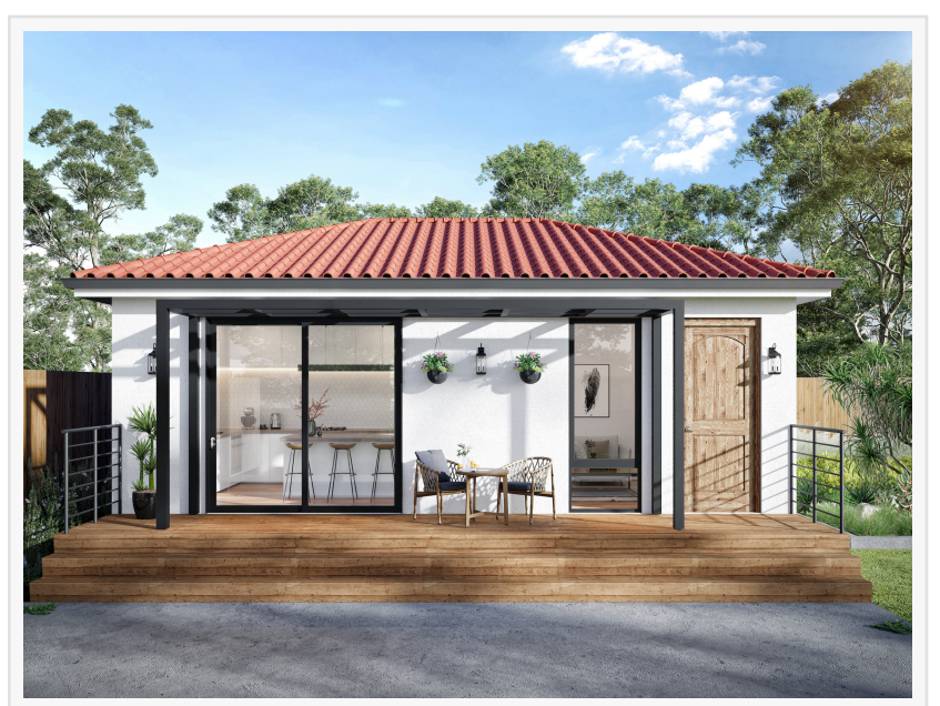
Spanish / Mediterranean - 2 Bedroom ADU

The principals of OneStop ADU, have over 50 years of combined experience in the San Diego real estate market. As an invaluable partner with experience in this complex space, OneStop ADU offers a turnkey solution for homeowners to take advantage of this unprecedented opportunity. The company offers six pre-designed floor plans with three exterior architectural styles, handle the permitting process, offer a lender matching program, provide quality construction, and can provide exceptional property