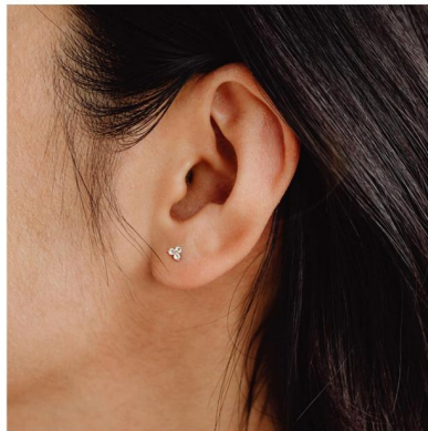
Trendolla flat back earrings