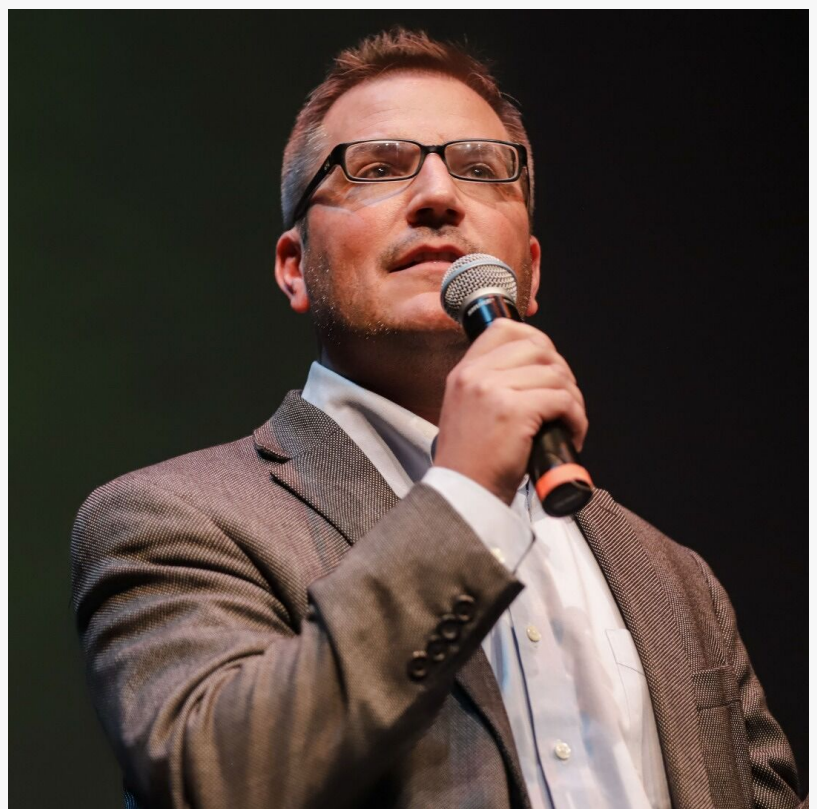
Author of 'CAPESTERS: A Hero Bureau Thriller' speaking at an event.