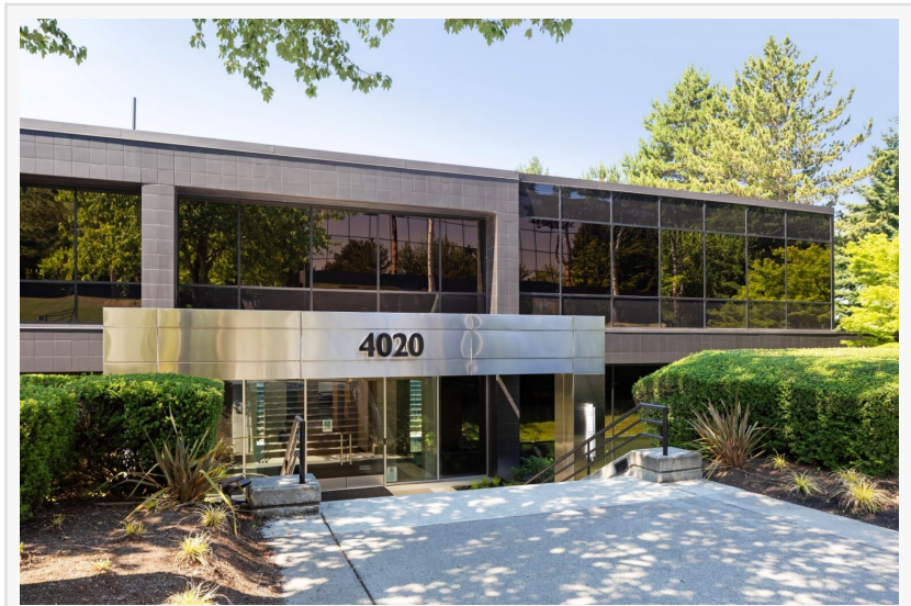
Outside the Kirkland clinic

Courtney Marti Active Recovery TMS +1 503-966-1132 cmarti@activercoverytms.com Visit us on social media: