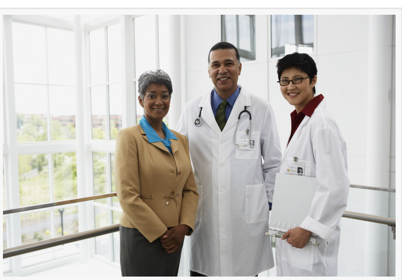
Our Mesothelioma Options Help Center is affiliated with doctors around the country.

Unfortunately, multiple vermiculite processing plants in Wyoming received asbestos-contaminated vermiculite from the notorious mine in Libby, Montana. In addition, Wyoming contains 12 known natural asbestos deposits. Residents of the state who worked in oil refineries, power plants and chemical plants are at an elevated risk of developing mesothelioma or asbestos-related lung cancer. www.mesotheliomaoptions.com