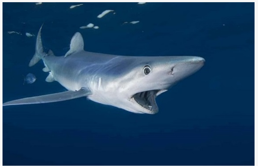
Sharks are in dire need of protection from finning

WASHINGTON, D.C., UNITED STATES , December 16, 2022 / EINPresswire.com/ -- Congress passed the Shark Fin Sales Elimination Act tonight as an amendment to the National Defense Authorization Act, sending the measure to President Biden for his signature in a matter of days. Last week, the Congress sent a captive wildlife protection measure – the Big Cat Public Safety Act – to the President to be signed into law as well.