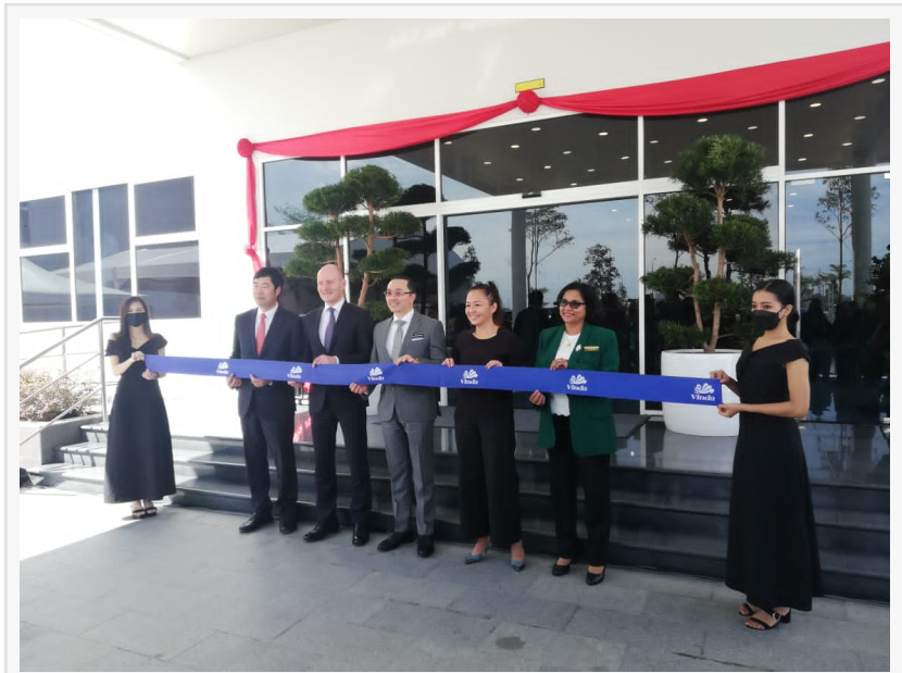
The inauguration of the new Vinda SEA Regional Hub in Bandar Bukit Raja, Selangor

EINPresswire.com/ -- Vinda Southeast Asia (Vinda SEA), a unit of Hong Kong-listed Vinda International Holdings Ltd, officially opens the new Vinda SEA Regional Hub today; situated in Bandar Bukit Raja, Selangor's industrial township. With an investment of RM700.5 million, the new state-of-the-art mega facility is located on a 30-acre site filled with greenery and comprises a double-storey manufacturing plant with raw material warehouse, an automated finished goods warehouse, a distribution centre, the Vinda Innovation Centre as well as a six-storey administration block.