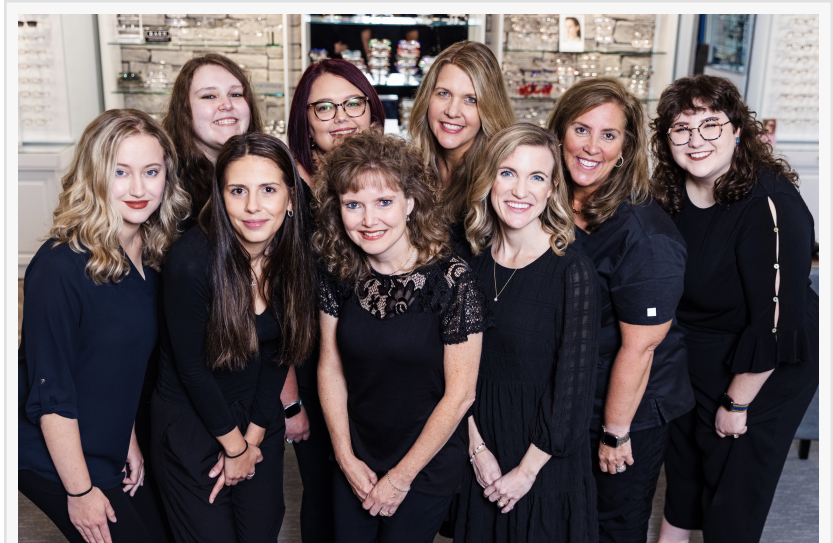
Madeira Optical Optometrists & Opticians

CINCINNATI, OHIO, USA, February 15, 2023 /EINPresswire.com/ -- Madeira Optical has been serving nearby families with pediatric optometry since 1956. In 2020 our largest cohort was pediatric patients under 18. It has always been important to have your child's eyes examined in their first year to for early detection of treatable eye conditions and prior to school to identify issues that might hinder learning. Every year a parent is surprised to learn that their child needs vision correction because of challenges at school.