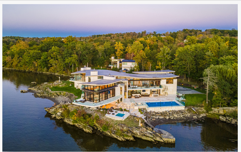
46 Ledgerock Lane | Rhinebeck, NY

/EINPresswire.com/ -- This private, modern masterpiece will auction in January via Sotheby's Concierge Auctions in cooperation with listing agent Jason Karadus of Corcoran Country Living. 46 Ledgerock Lane is currently listed for $45 million, the property is selling to the highest bidder, without reserve. Bidding is scheduled to be held on 18–24 January, via the firm's digital marketplace, casothebys.com , allowing buyers to bid remotely from anywhere in the world.