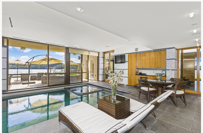
Accessible by car, boat, seaplane, or helicopter