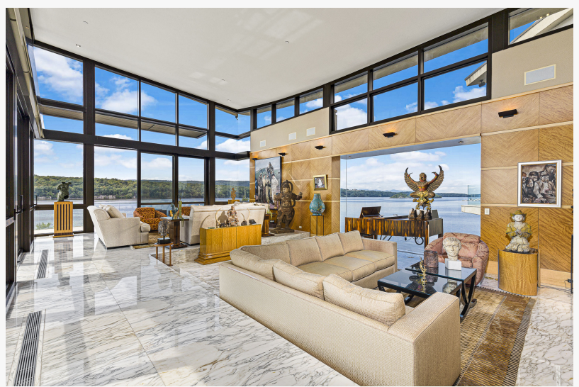
Designed by architect Lee Ledbetter

The property itself is 14,800 square feet and sits on 10.69 acres of land, directly on the Hudson River. The home has five bedrooms, seven full bathrooms, and one half bathroom. Inside, discover 46 Ledgerrock Lane's 18-28 foot ceilings and unique wood paneling. Discover a sunken conversation area, a spacious study with bookshelves, and an elevator. Enjoy the saltwater pool outside, or sit by the indoor pool/sauna with its own lounge area. The home also features a three car garage, billiard room, and an outdoor kitchen with dumbwaiter. The estate is accessible by car, boat, seaplane, or helicopter. 46 Ledgerrock Lane is a 90-minute drive to Manhattan, two hours to New Haven, and four hours from the Hamptons. Find nearby airports,