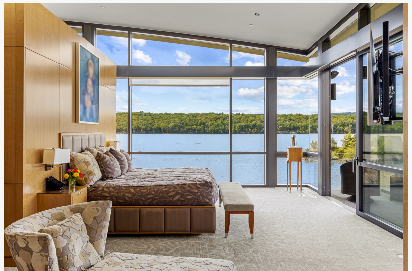
Stunning views, sitting directly on the Hudson River