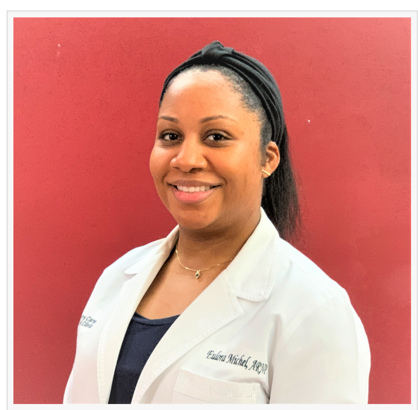
Family Certified Nurse Practitioner

Primary Care Walk-in Clinic "An Emergency Alternative" (both locations) treats COVID Positive patients with Prednisone, Paxlovid and Z-Pack irrespective of whether they are symptomatic or not. They are checked again in 7 days. Most of them are negative. The repeat positive ones, if positive and symptomatic, they are treated with Doxycycline and sent for CXR. Patients that show Pneumonia on CXR, are treated with 1 gram Rocephin I/M daily for 10 days. If patients have checked COVID at home, they are checked for Flu A & B in the office. If positive they are treated with Tamiflu.