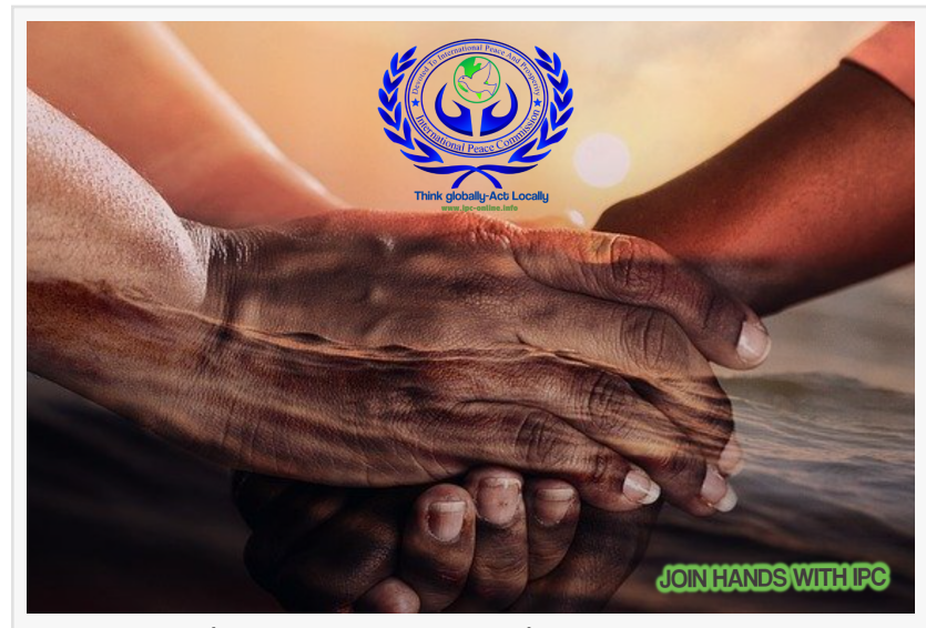
Human Rights are not optional

International Peace Commission is dedicated to amassing a huge range of Civil Society Organizations starting from local to international levels. It focuses on various aspects for the betterment of the global society including the youth, women empowerment, labor, education, environment, and so on.