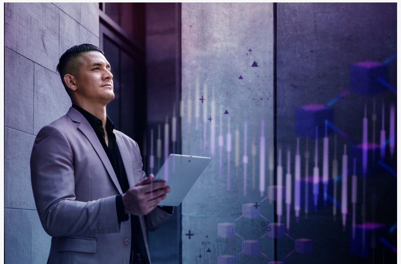
Elvio Ciarla Cryptocurrency Investing

Leading financial expert and author, Elvio Ciarla, has just released a new guide for investing for beginners. Is a comprehensive article that covers all the essential topics and strategies for investing in today's market.