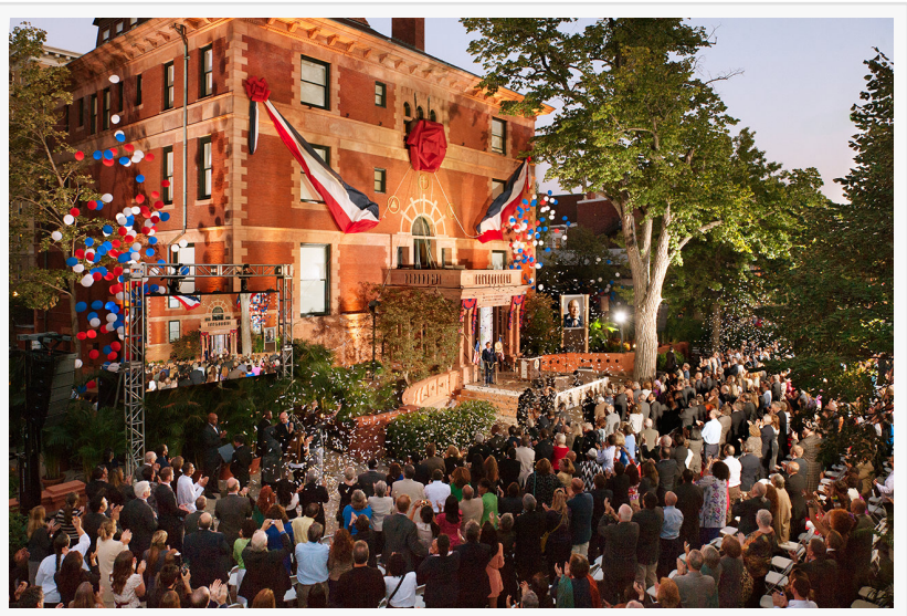
Hundreds fill the street at the Grand Opening of the National Affairs Office in 2012 – now celebrating its 10th anniversary.

WASHINGTON, DC, USA, December 20, 2022 /EINPresswire.com/ -- On the 10th anniversary of the opening of the Church of Scientology <u>National Affairs</u> <u>Office</u> a celebration was held at its Dupont Circle headquarters in the historic Fraser Mansion to honor the event and remember what has been achieved.