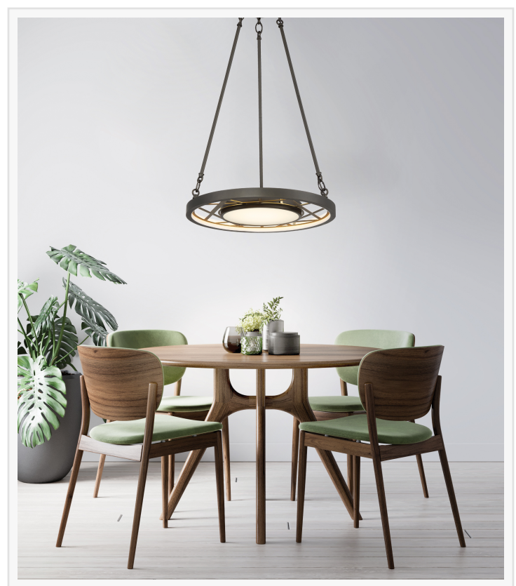
The Tribeca Collection takes its inspiration from Robin Baron's Signature Lighting Collections and invokes a downtown NYC meets artsy industrial-chic look.

Dallas Market Center is a global business-tobusiness trade center and the leading wholesale marketplace in North America