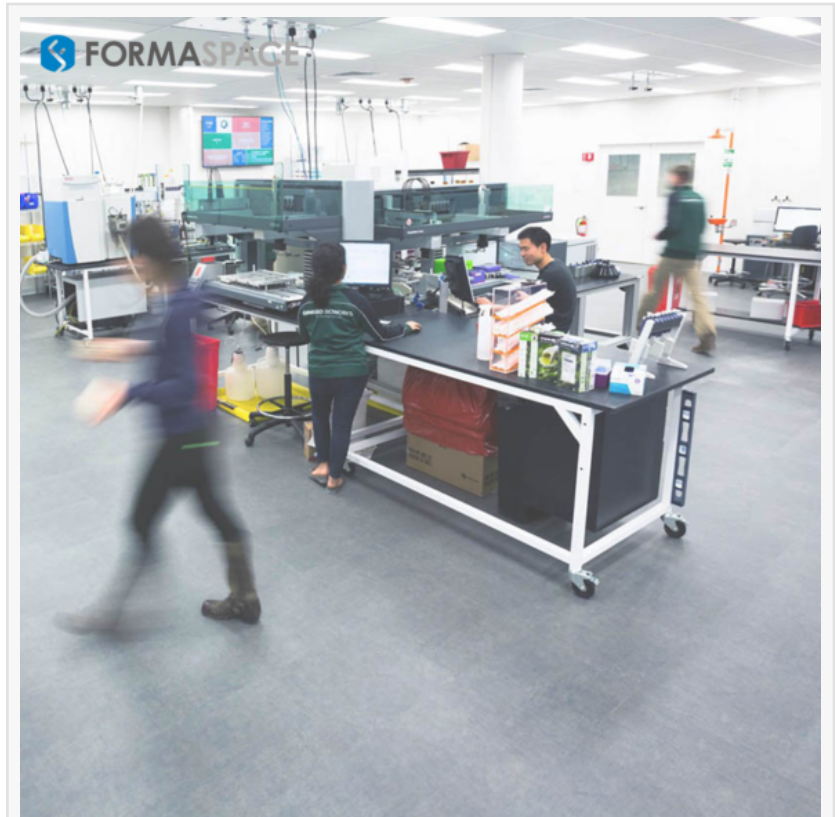
Ginkgo Bioworks chose Formaspace modular workbenches for their automated pipetting robots and other automated lab equipment.