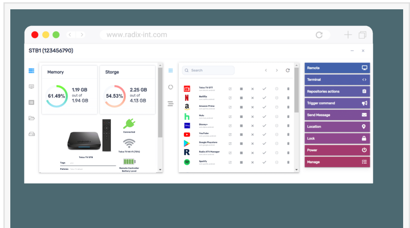
radix android tv device dashboard

All customers looking to manage their fleet of digital devices are welcome to visit us at Venetian Expo, Level 1, Hall G, Booth 62000, Stand 7, Eureka Park